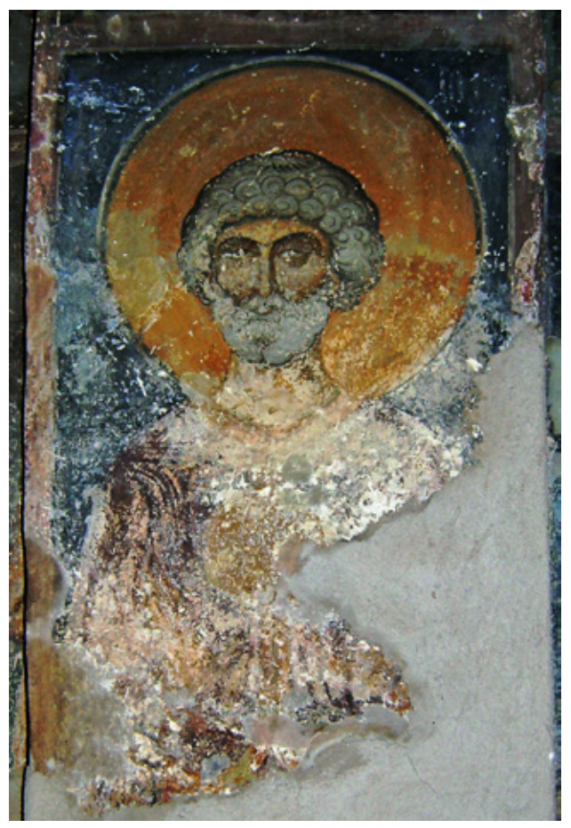
fig. 5 St. Menas, St. George at Pološko

also consistent with the descriptions in the painting manuals<sup>23</sup>. St. Menas is usually depicted as a martyr. Sometimes he appears with a medallion portrait of the head of Christ suspended before his breast<sup>24</sup>. Although St. Menas is a warrior he is rarely depicted in military outfits. The preserved exemples testify that he is depicted in his military attire in the churches built by serbian nobles<sup>25</sup>. Most often saint Menas is