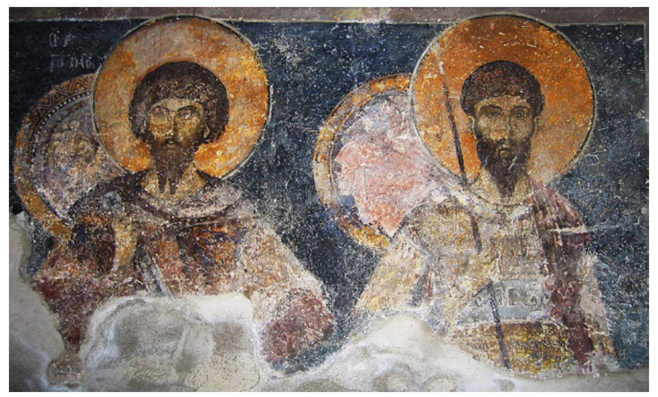
fig. 4 St. Theodore Tyron and St. Theodore Stratelates, St. George at Pološko

The cult of the two Sts. Theodores developed out of number of legends that in the beginning mentioned only one Theodore. The two Theodores appeared in the ninth century when in the texts are distinguished two different saints: Theodore Tyron (the recruit) and Theodore Stratelates (the general)<sup>18</sup>. The cult of St. Theodor spread from Asia Minor. After the Turkish conquest of Asia Minor at the end of the 11th century their cult becomes even more popular with the transport of their relics to Constantinople and Serres. As one of the most popular warrior saints they are usually included in the the group of warrior saints in Byzantium and accordingly in medieval Serbia.