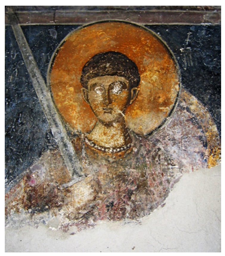
fig. 3 St. Demetrios, St. George at Pološko

As already mentioned the church was dedicated to St. George Triomphant. Unfortunately it is impossible to know if this epithet was also given to the representation of St. George next to the iconostasis. That was already the case on the iconostasis in Staro Nagoričino where St. George depicted with a drawn sword is named Triomphant<sup>12</sup>. The iconography of St. George with a drawn sword associated with the epithet of Triomphant continued in the later period as attested in the church of the Dormition of the Virgin in Zevgostasion (Dolanini) dating from the second half of the 14th century<sup>13</sup>.