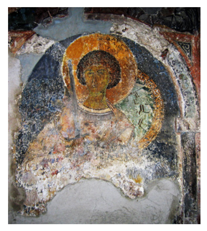
fig. 1 St. George, St. George at Pološko